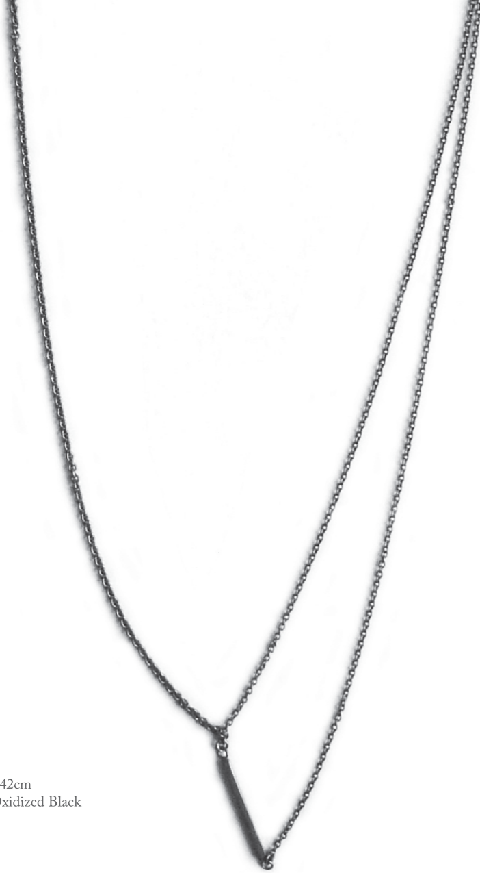
2. Length: 42cm Color: Oxidized Black