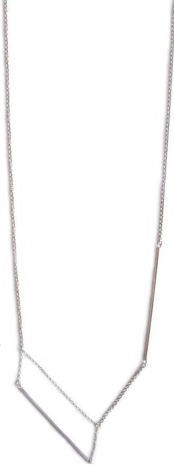
6. Length: 58cm Color: Natural Silver