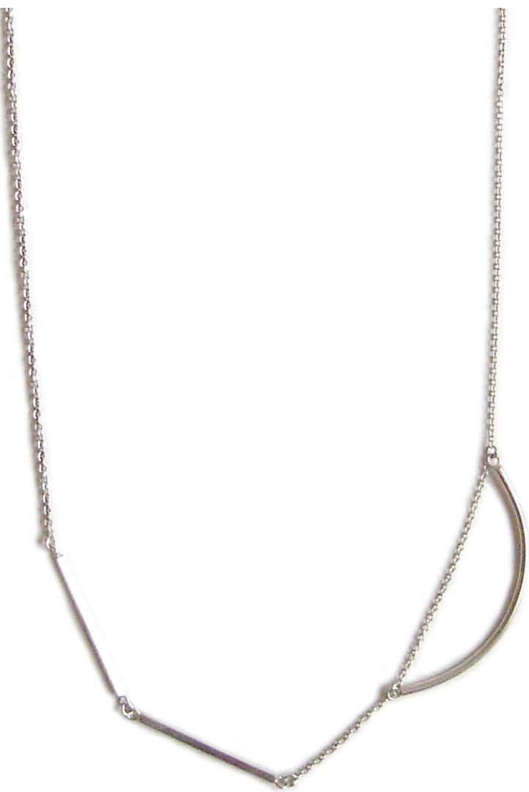
5. Length: 42cm Color: Natural Silver