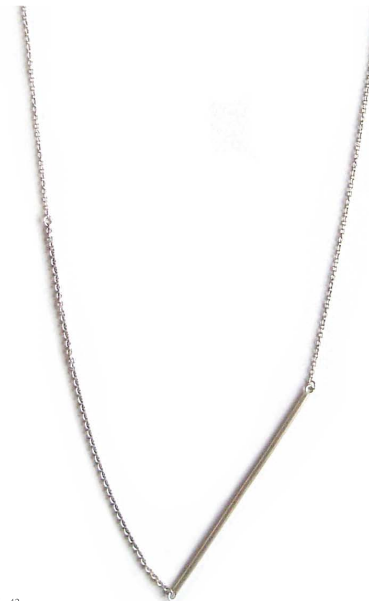
1. Length: 42cm Color: Natural Silver