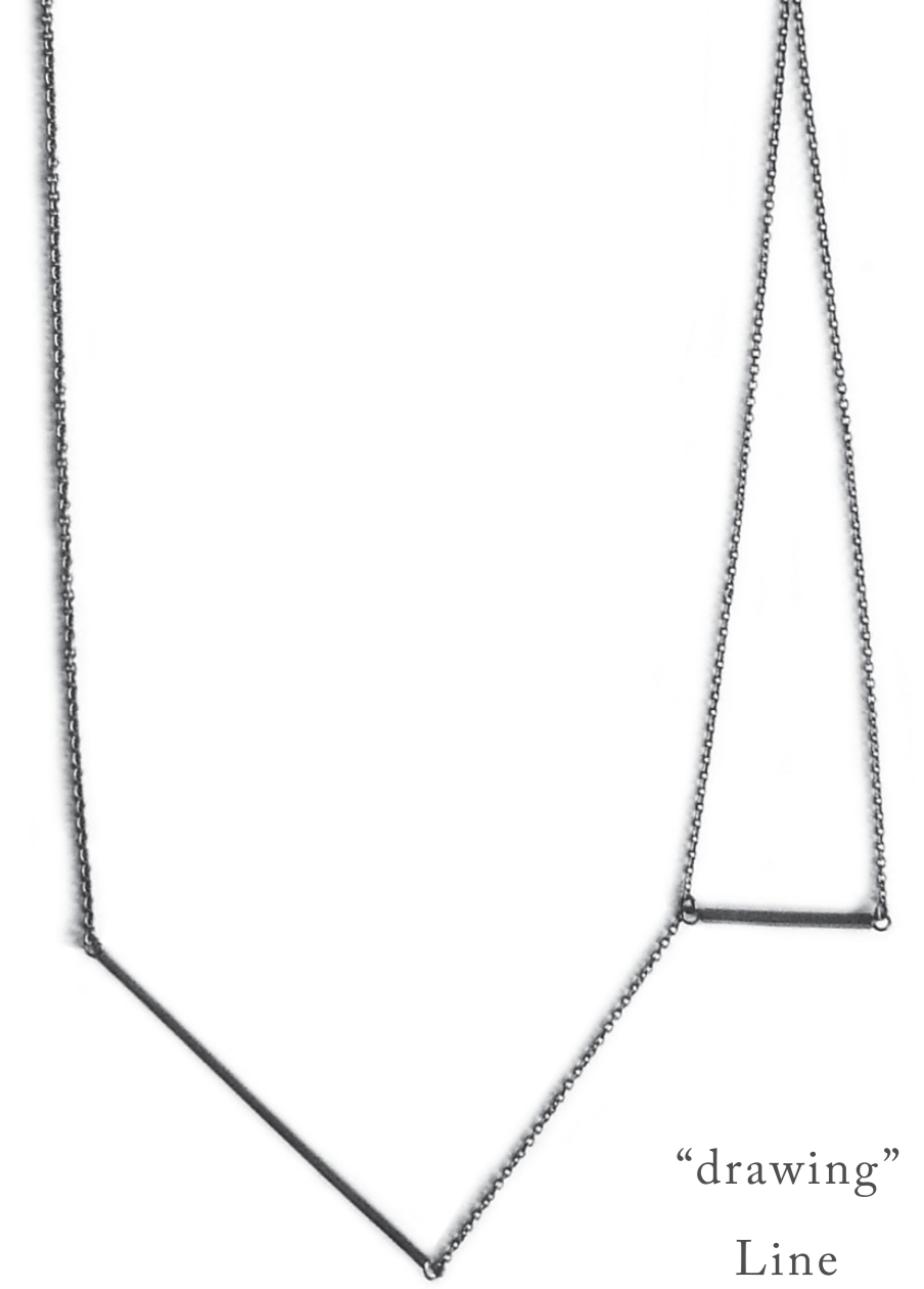
"drawing" Line SS 2010

right item 4. Length: 50cm Color: Oxidized Black