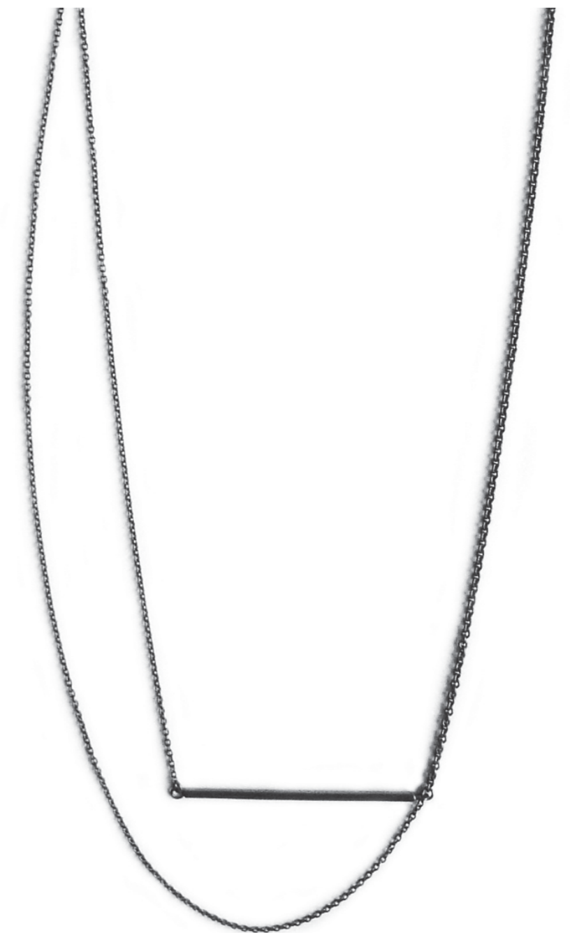
3. Length: 46cm Color: Oxidized Black