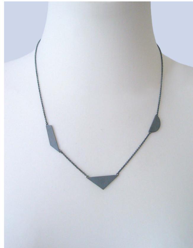
4. Length: 50cm Color: Oxidized Black