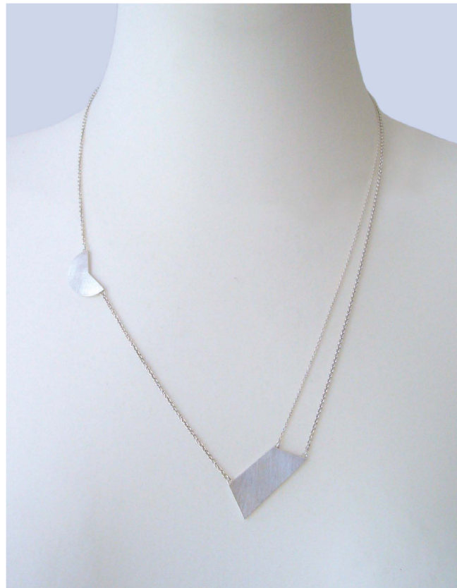
5. Length: 56cm Color: Natural Silver