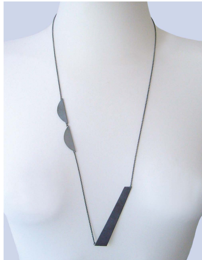
6. Length: 75cm Color: Oxidized Black